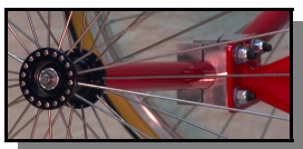
Quick release rear wheel and rear axle assembly

These handcycles are known for their durability, front wheel traction and maneuverability. One unique feature that is not offered by any other handcycle is their two piece quick release frame. By pulling one pin the frame is easily separated into two easily handled pieces for convenient transport by car or plane. Also, the quick release rear wheels and an easily removable axle make transport a snap. The Freedom Ryder features Shimano components and rolls on 26" X 559 wheels. Unlike many other handcycles, the two piece padded seat, quick release frame, anodizing throughout and orange visibility flag are all standard features on these classic Freedom Ryders.