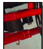
Quick frame separation