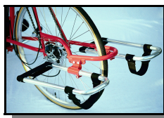
Independently adjustable footrests