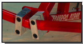
Removable rear axle assembly